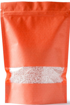
Efficient, reliable and safe handling of convenience food